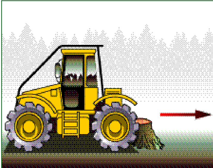
Figure 1 Stump used as anchor